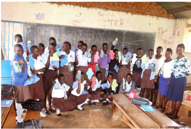
Youth produced reusable feminine hygiene kits and liquid soap distributed to vulnerable girls at Crested Crane School.

Opened in 2013, the Abukloi Secondary school serves the needs of students in and around the small city of Rumbek, located in the central region of South Sudan. It enrolls over 660 students, of whom 175 are young women. Their curriculum emphasizes lessons in peaceful solutions to conflicts, both traditional and vocational skills, and community service.